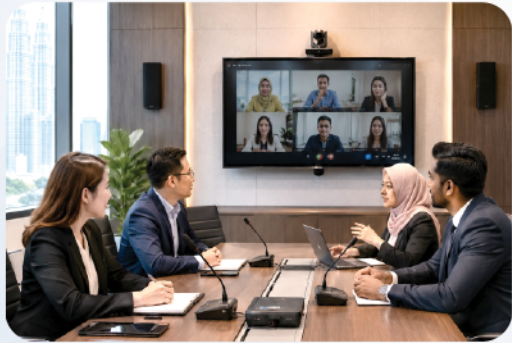
Meeting & Conference Rooms

We deliver customised AV solutions across a wide range of environments: