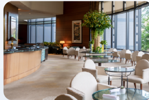
Hospitality & Restaurants