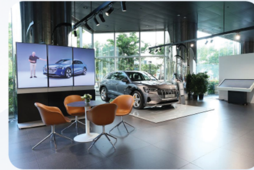
Showrooms & Galleries