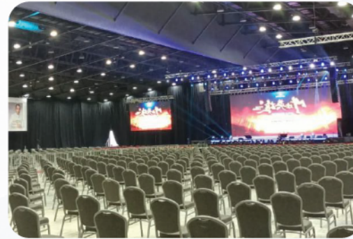
Convention & Exhibition Halls