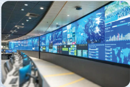
Control & Command Rooms