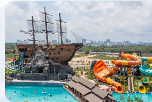
Outdoor Leisure & Recreational Parks