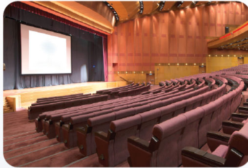
Auditorium & Banquet Hall